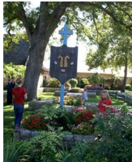
The grounds of St. Barnabas